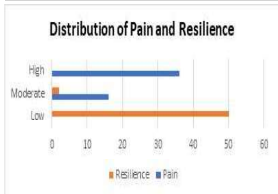
Figure 2. Distribution of Pain and Resilience

Pearson's Product Moment Correlation was computed to understand the relationship between pain and resilience among women.