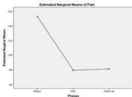
Figure 3. Profile plots of Pain in the Before, After, and Follow-up Phases for the Participants

Also, there is a significant mean difference in the after and follow-up phases ( M=1.71 , SE=1.96 ). The above table also shows a significant mean difference in the follow-up and the before phases ( M=39.44 , SE=2.49 ). Also, there is a significant mean difference in the follow-up and after intervention phases ( M=-1.71 , SE=1.96 ). The profile plots for the significant difference are shown below.